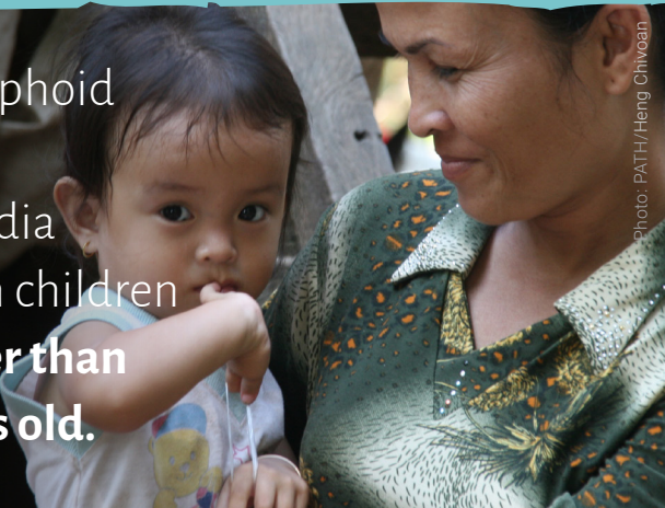
TYPHOID CASES IN CAMBODIA BY AGE (2023)

Most typhoid cases in Cambodia occur in children younger than 15 years old.