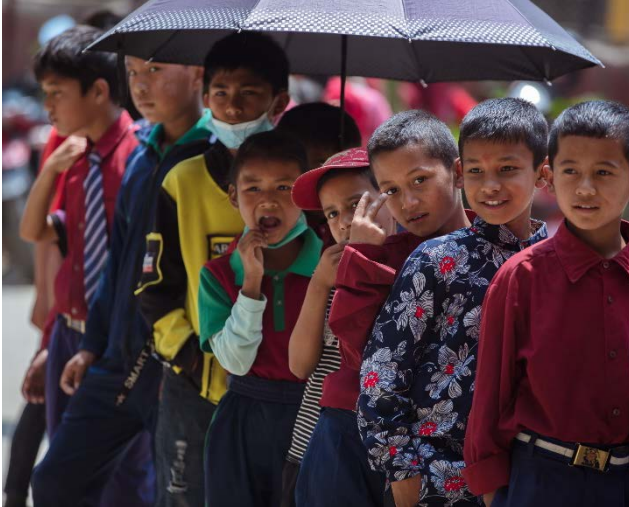
Children line up to receive TCV at their school, April 2022.

Kathmandu found 1,062 cases of typhoid per 100,000 people. 4