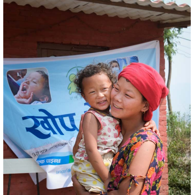
A mom waits with her daughter to receive TCV during Nepal's introduction campaign in April 2022.

Typhoid also imposes an economic burden in Nepal. One study in Kathmandu found that average total costs for a hospitalized typhoid patient were US$233, one third of the average Nepali family's annual income. 5 Findings from an economic analysis predict that, even in the absence of a Gavi subsidy, a catch-up campaign followed by routine childhood immunization with TCVs could be cost-effective in Nepal. 6 The Government of Nepal introduced TCV into its routine immunization program in 2022.