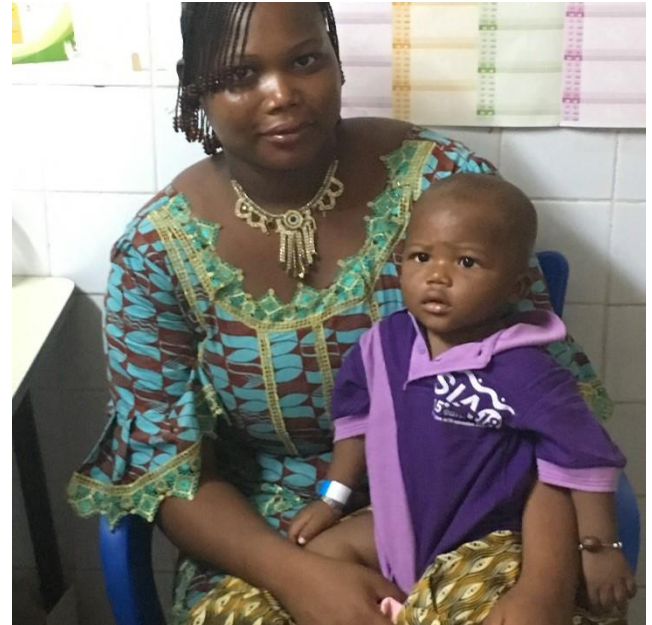
Groupe de Recherche Action en Santé

In order to build evidence of the effectiveness of TCVs in protecting children from typhoid, researchers with the Typhoid Vaccine Acceleration Consortium (TyVAC) conducted four different studies in Bangladesh, Burkina Faso, Malawi, and Nepal. In Burkina Faso, TyVAC and project partners studied how well TCVs produce an immune response to typhoid in children between 9 months and 2 years of age as well as the safety of the vaccine when given alone or alongside other routine childhood vaccines. The study found that TCV can be successfully co-administered to children with yellow fever, meningococcal A, and measles-rubella vaccines. 4,5 While WHO already recommends TCV introduction in all typhoid-endemic countries, this additional evidence will help inform ongoing decisions about TCV vaccination in low- and middle-income countries.