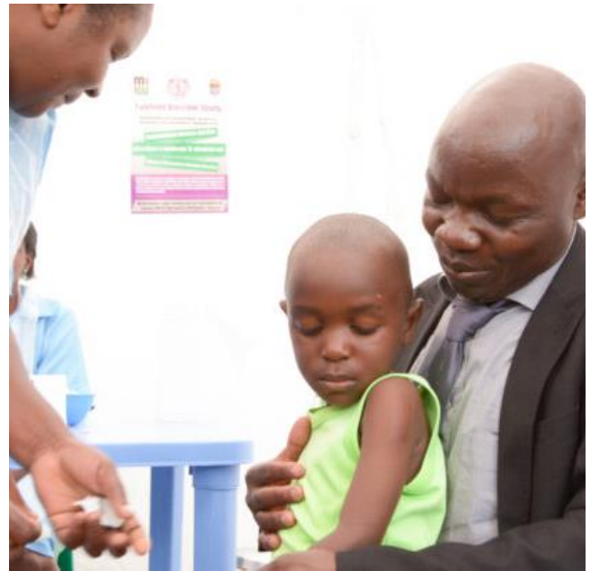
Sabin Vaccine Institute

In March 2018, the World Health Organization (WHO) recommended that typhoid-endemic countries